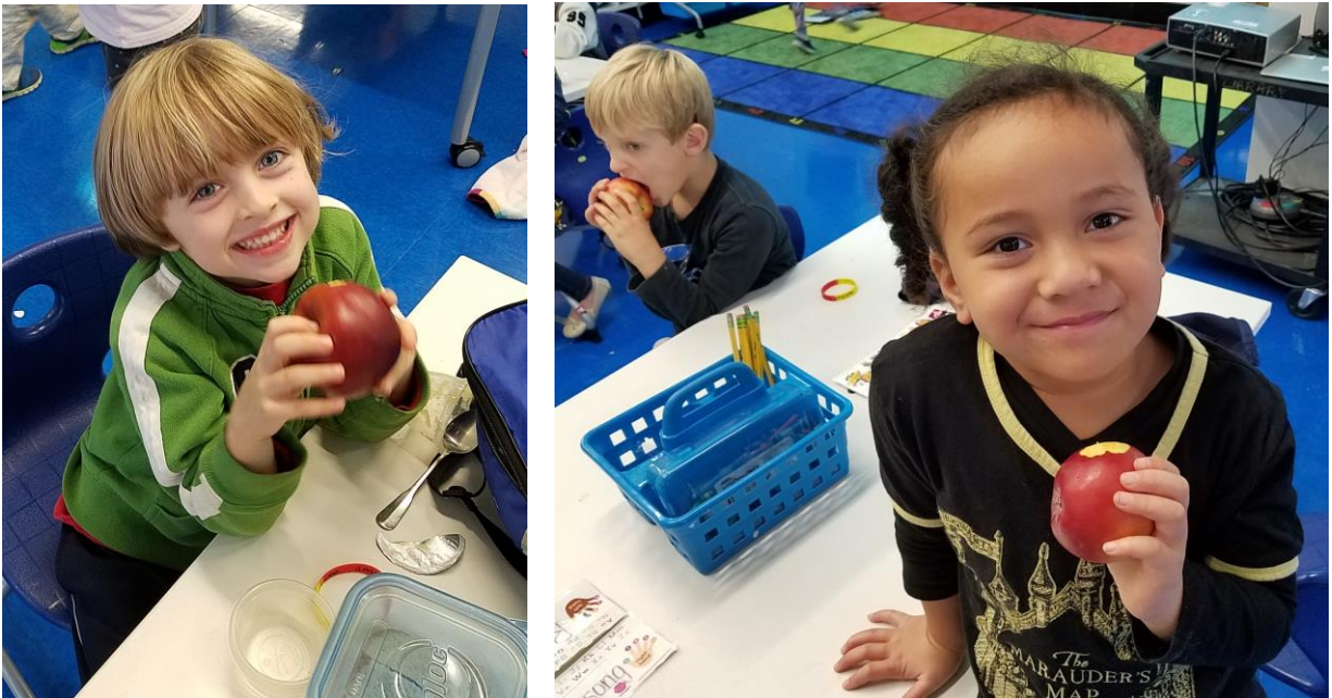
Apples for Aces Smiles

thanks to a handy map, we threw in a geography lesson too. Tennis can take you in so many different directions with kids. We may be reading about one of these kindergartners playing in Norway in ten years!”