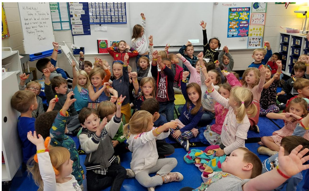
Kindergartners at Crozet Elementary showing off their Go Bananas! bracelets

Charlottesville, Virginia (10/26/2018) – QuickStart Tennis of Central Virginia, Inc. (QCV) is pleased to report a second year of Apples for Aces, a QCV tennis and nutrition campaign for kindergartners, is underway thanks to the generosity of Carter Mountain Orchard. More than 140 kindergartners at Crozet and Stone-Robinson Elementary Schools were treated to a Go Bananas for QuickStart! bracelet and poster card, the Go Bananas! nutrition card (WHY do tennis players eat apples?), an Apples for Aces sticker and a Red Delicious apple from Carter Mountain Orchard.