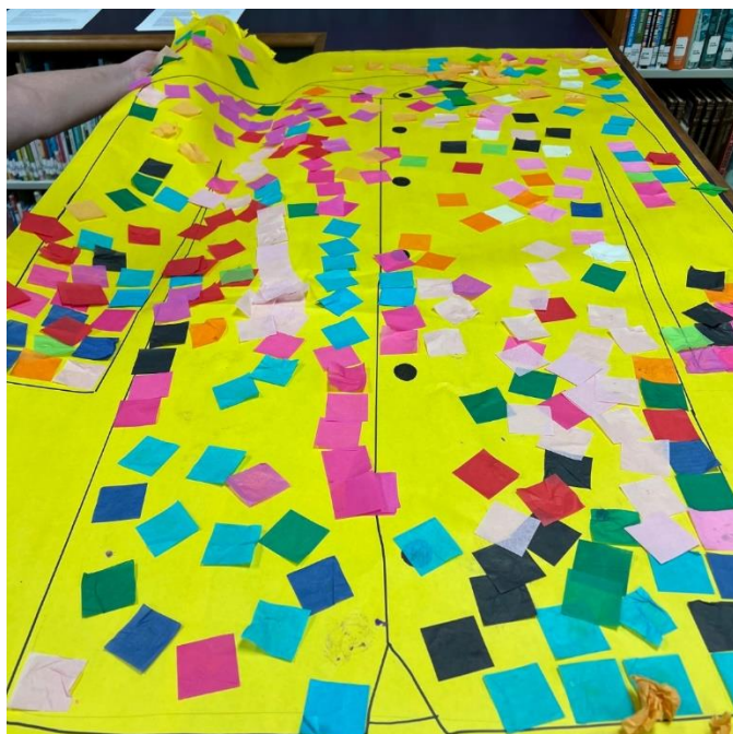
One of four coats of many colors

The kids also learned to play with clay and practiced drawing pictures. For refreshments they had lemonade and Halloween cookies. Volunteers from the Friends of the Library (FOL) and Alpha Delta Kappa (ADK is a sorority of retired educators) generously gave their time to make the event a success.