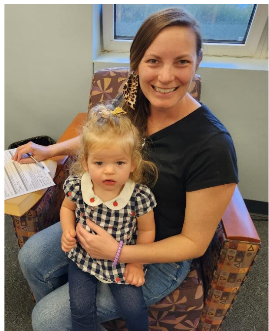
A brand new Dolly enrollee