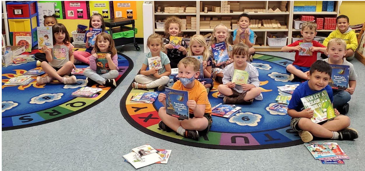
Racquets for Reading!!! Kids in Nelson County – May 2022

QuickStart Tennis of Central Virginia, Inc. (QCV), a Section 501(c)(3) tax-exempt organization, operates as a special-purpose Community Tennis Association (CTA) focused on QuickStart Tennis, the USTA's kid-sized format developed for kids 10 and under. The format is also adaptable for beginners of any age and players who feel less comfortable covering a full-size court. QCV promotes, develops and grows QuickStart Tennis in 28 counties (with the addition of Campbell County in October 2021) and three independent cities in central and southside Virginia. QCV uses tennis as a vehicle to create happy, healthy, active and literate kids in the communities it serves and enrich their lives through tennis.