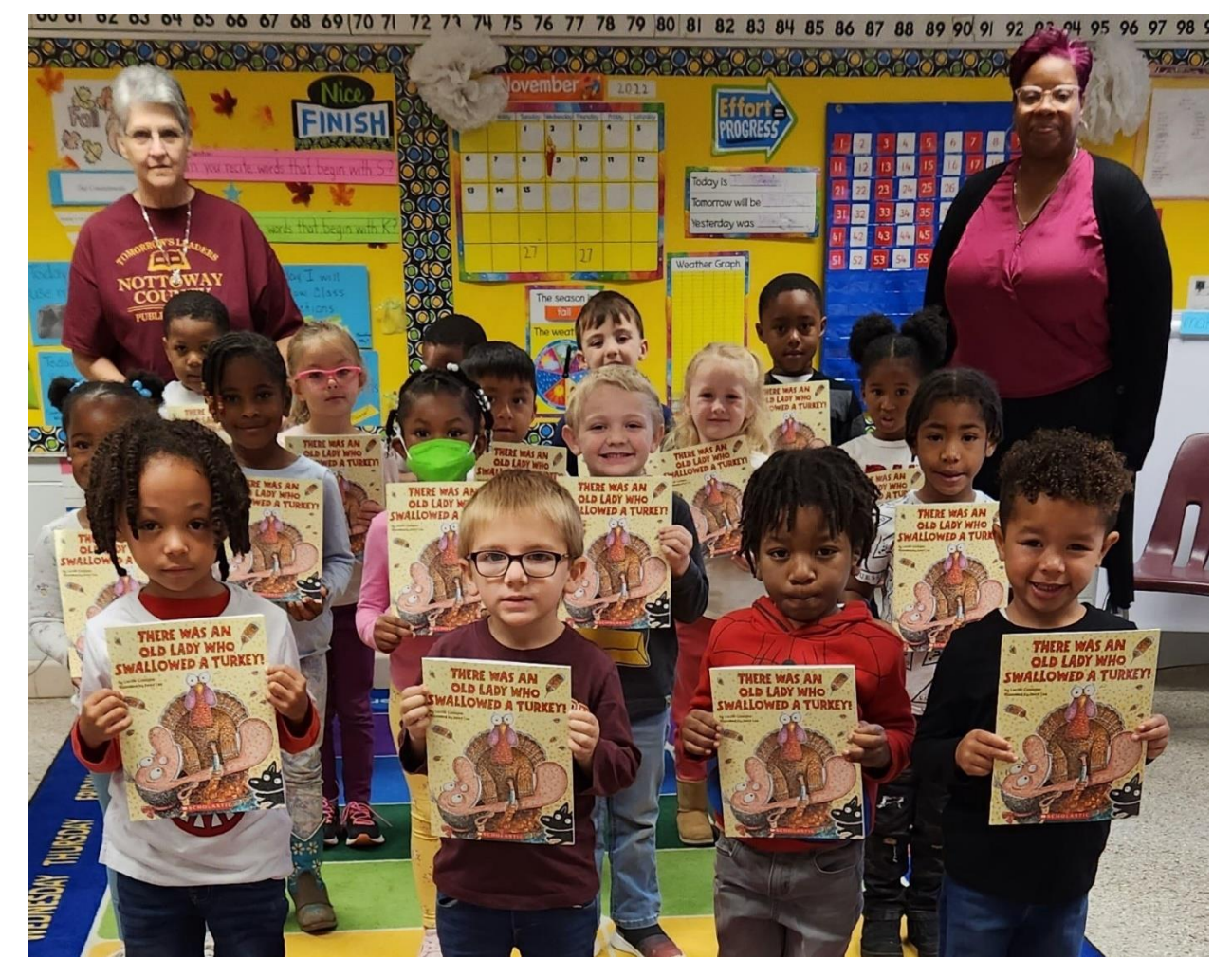
Preschoolers at Crewe Primary School