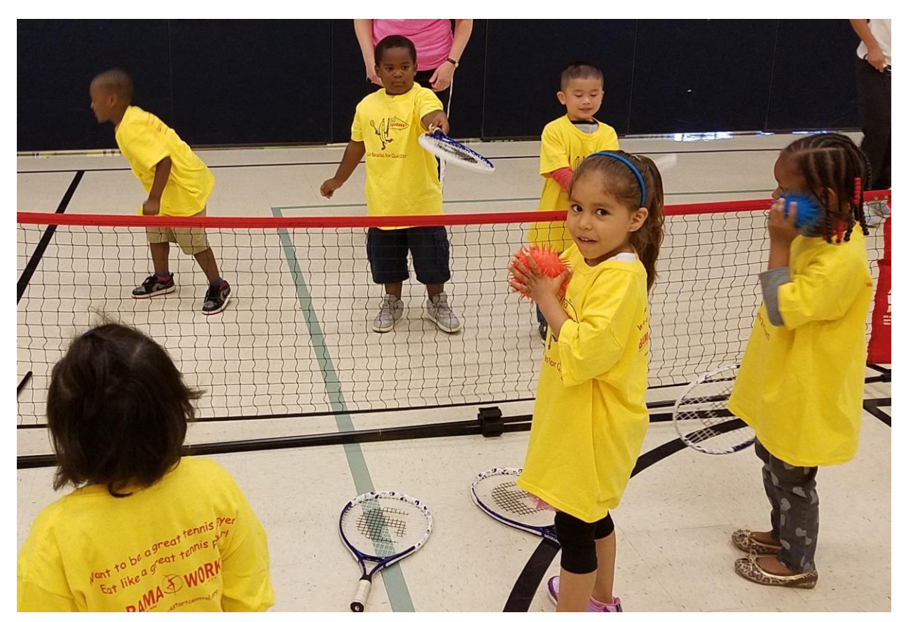
Want to be a great adult? Be a BrightSTARS kid!

The Party Parade funds will help us expand BrightSTARS into three additional elementary schools in Albemarle County during the upcoming school year. BrightSTARS will start its fourth year at Greer and second year at Cale Elementary in the fall. BrightSTARS is also available at five additional schools in Buckingham and Patrick counties and the cities of Danville and Martinsville.