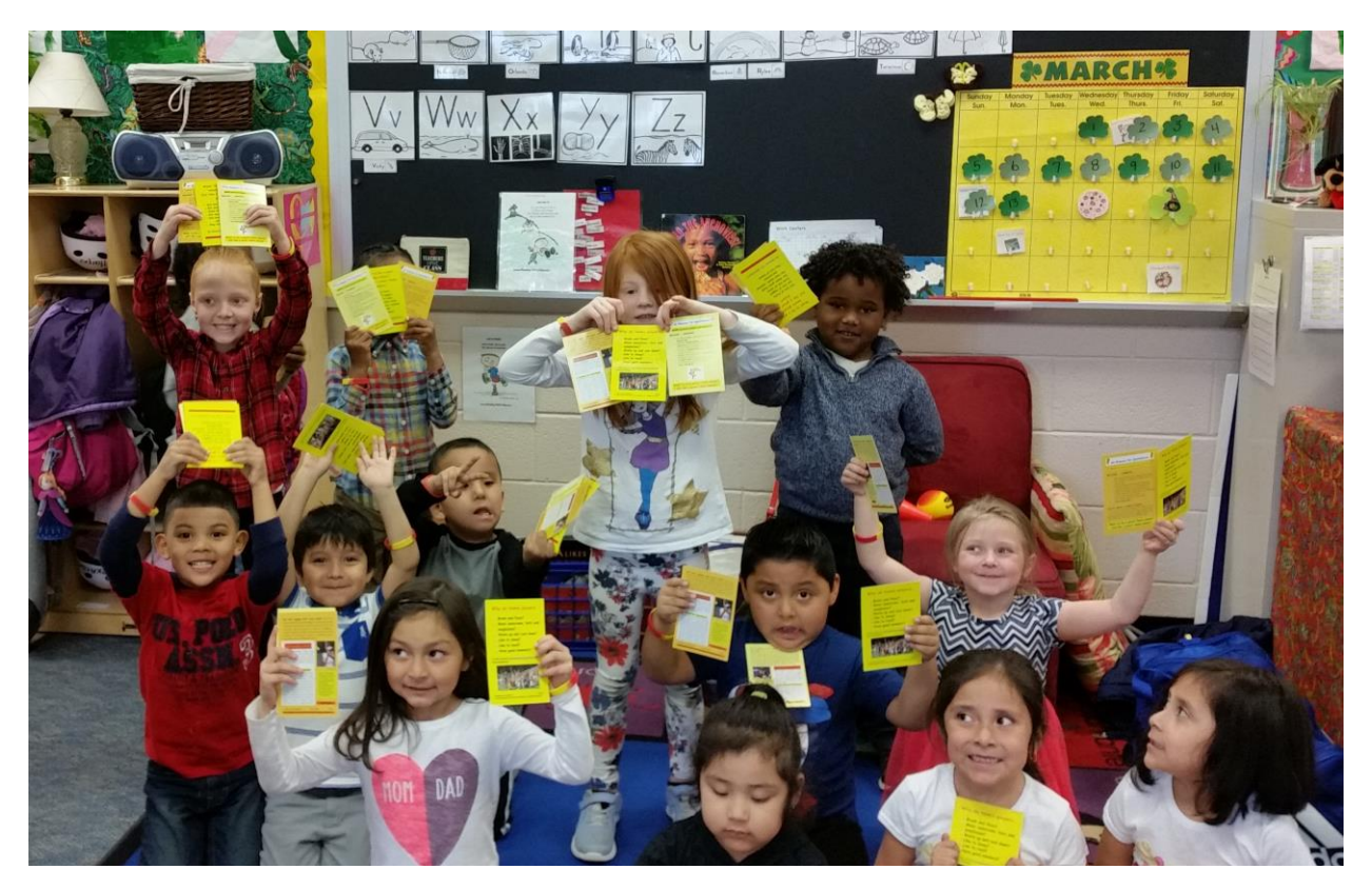
Go Bananas! at Agnor-Hurt Elementary

Charlottesville, Virginia (3/30/2017) – QuickStart Tennis of Central Virginia, Inc. (QCV) is pleased to report we recently completed a Go Bananas! Mini-Blitz for preschoolers in recognition of March's designation as National Nutrition Month. We made Go Bananas! visits to the Virginia Preschool Initiative classes at Agnor-Hurt, Stone Robinson and Red Hill Elementary schools.