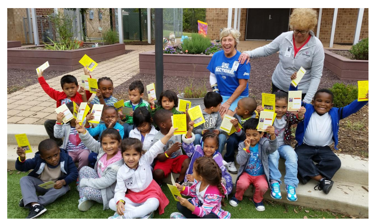
Going Bananas! at Greer Elementary School

Charlottesville, Virginia (2/2/2017) – QuickStart Tennis of Central Virginia, Inc. (QCV) is pleased to report QCV's Go Bananas for QuickStart! campaign has received a generous grant from the Bama Works Fund in the Charlottesville Area Community Foundation. This grant will enable QCV to print a third edition of the Go Bananas! poster and numerous Go Bananas! nutrition cards. It also will allow QCV to purchase giveaways for kids – Go Bananas! bracelets, drawstring bags, t-shirts, water bottles, racquets and balls – reminders to reinforce being active and eating healthy foods. Each year, QCV reaches 1,500 to 2,000 kids through Go Bananas! visits to PE classes, after-school programs and summer camps and participation in a variety of community events.