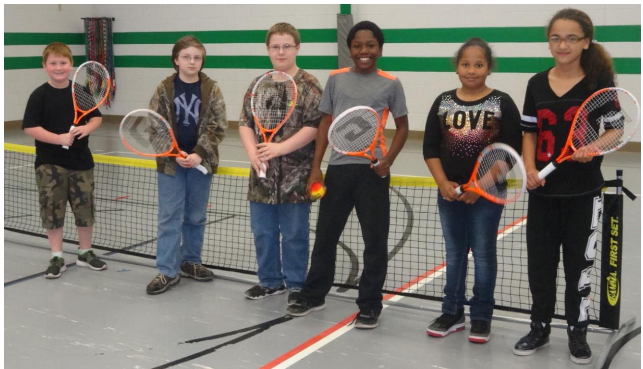
Our Goal: A racquet in every hand! A smile on every face in every Pittsylvania County Public School!

Charlottesville, Virginia (5/24/2016) – QuickStart Tennis of Central Virginia (QCV) is pleased to report it has received a generous grant from the Womack Foundation. This grant will be used to equip four schools in Pittsylvania County and will bring the total number of schools equipped to 14 out of 18. Pittsylvania PE teachers and other members of the community were trained last August and schools have been sharing equipment until funds can be raised to equip all schools.